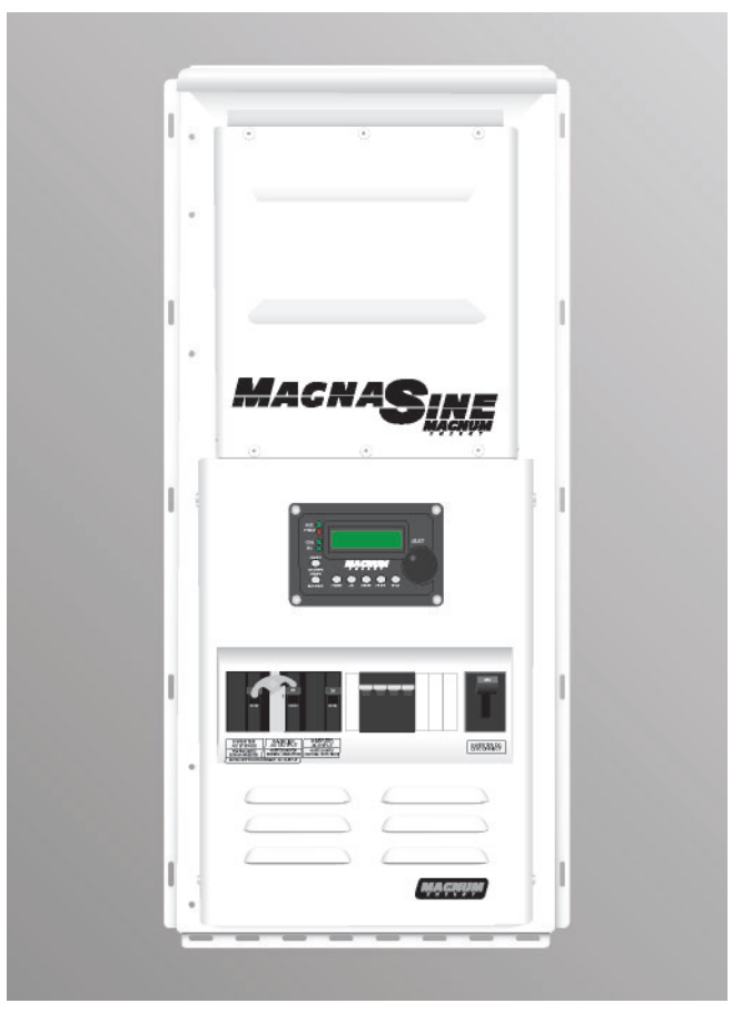
The MMP Enclosure

The MMP shown with inverter (sold separately) and optional remote and backplate.