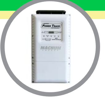
Up to seven (7) PT-100 Charge Controllers for 42kW output at 48V