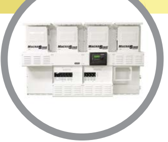
Magnum Energy MPDH Panel and four MS-PAE Inverter/Chargers